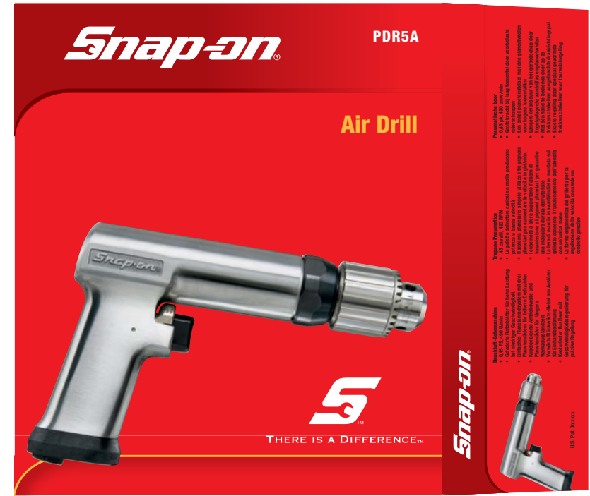
Example #2 The placement of the photo can be adjusted. Whenever possible, the photo should bleed off the bottom, or be anchored to the bottom bar, as shown above. In extreme cases, the photo can float in the center of the package. On the front of the package, the photo should not bleed off the sides.